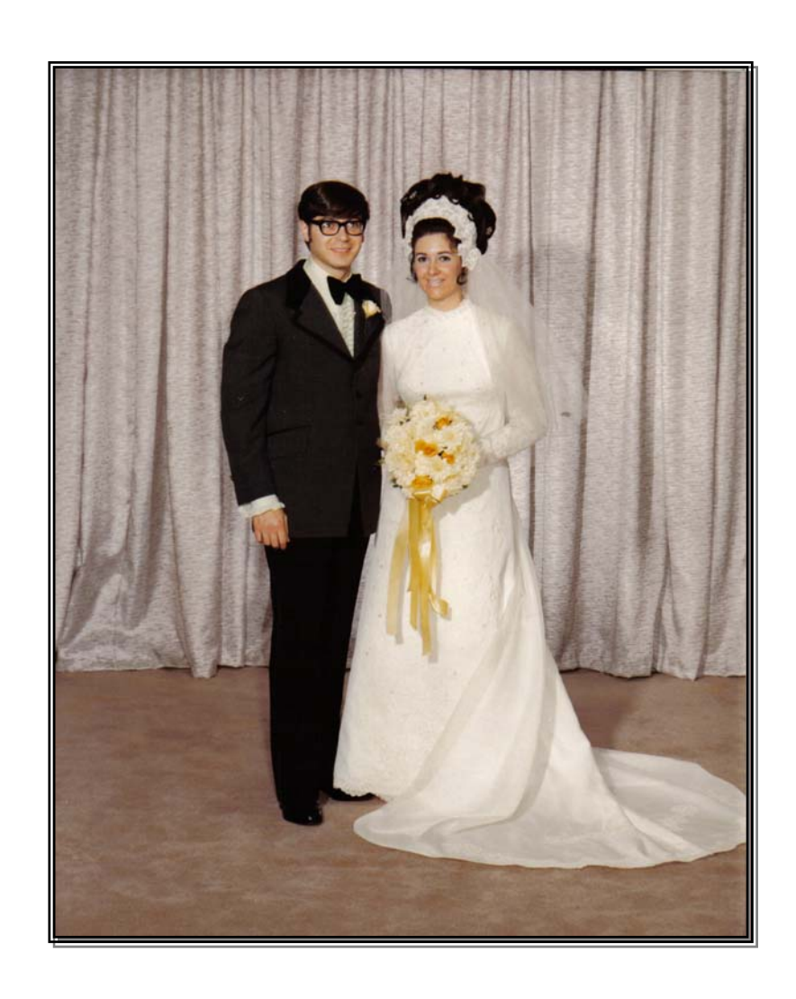
On this day I will marry my friend,